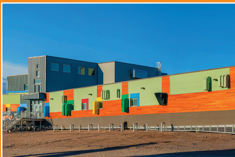
Tuugaalik High School