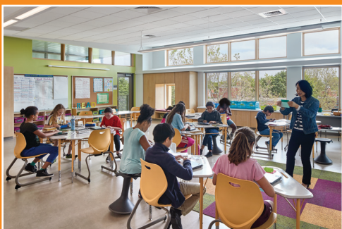
Dr. Martin Luther King, Jr. School