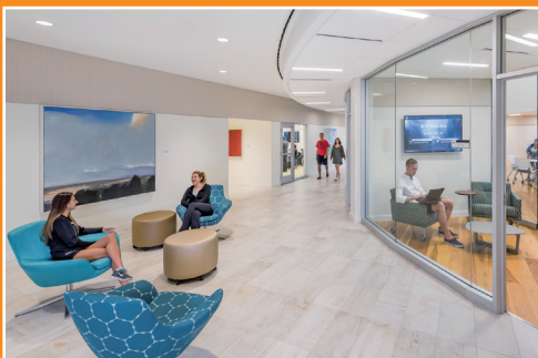
Bryant University-Academic Innovation Center